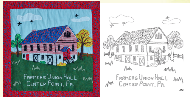
Worcester Historical Society Coloring Book page example.

In celebration of both the country's 250th anniversary and the Society's 50th anniversary, new initiatives were planned. The Society decided to publish a coloring book featuring the Bicentennial Quilt and to organize a quilt tour throughout the township, beginning with the historic churches.