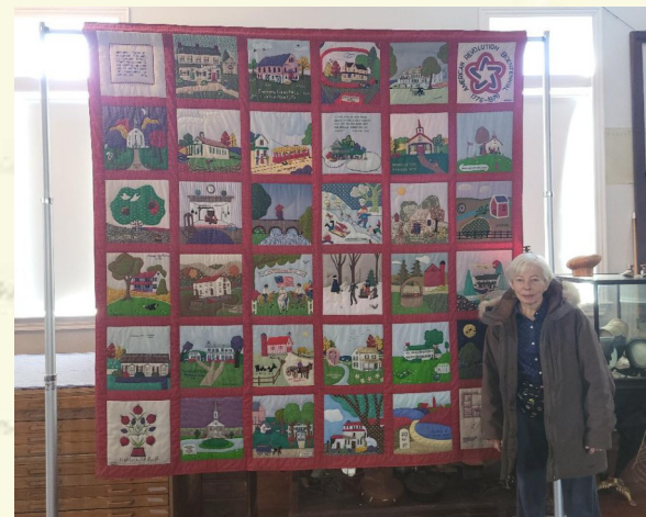
1976 Worcester Historical Society's quilt ready for travel.

We invite you to enjoy both the quilt and the coloring book. Your participation in the Worcester Historical Society programs supports our ongoing efforts to safeguard the township's heritage for future generations. Follow us at our website, Worcesterhistorical.org , or on Facebook, and please become a member!